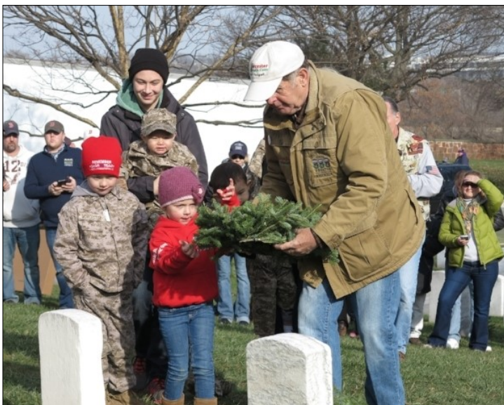
National Wreaths Across America begins Dec. 16.

Each December, wreath-laying ceremonies are held at Arlington National Cemetery as well as more than 1,200 additional locations in all 50 U.S. states, at sea and abroad.